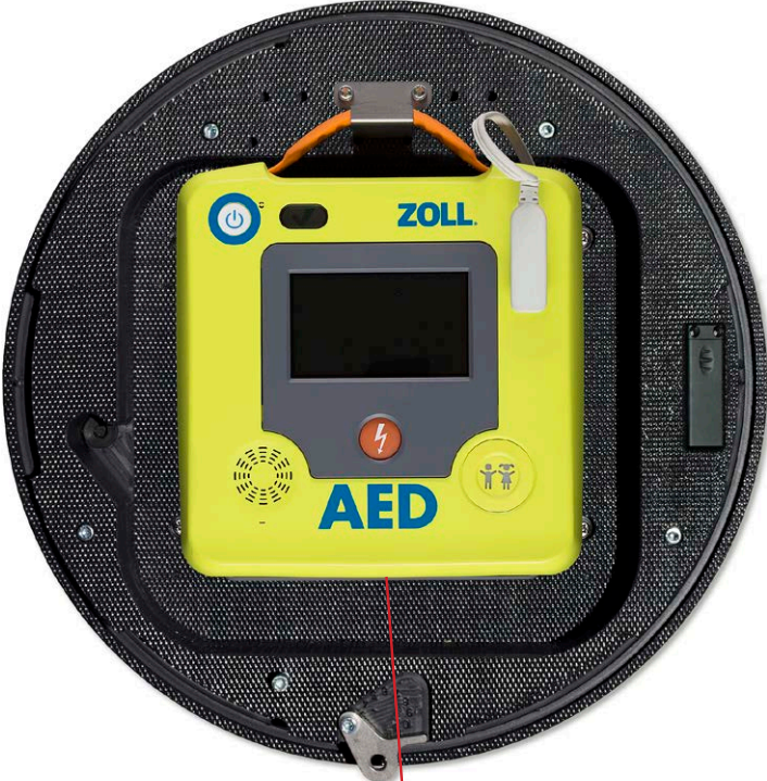
AED Plus (install without bag)