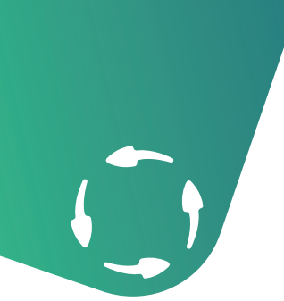
Powerheart G3 (Elite/Plus)